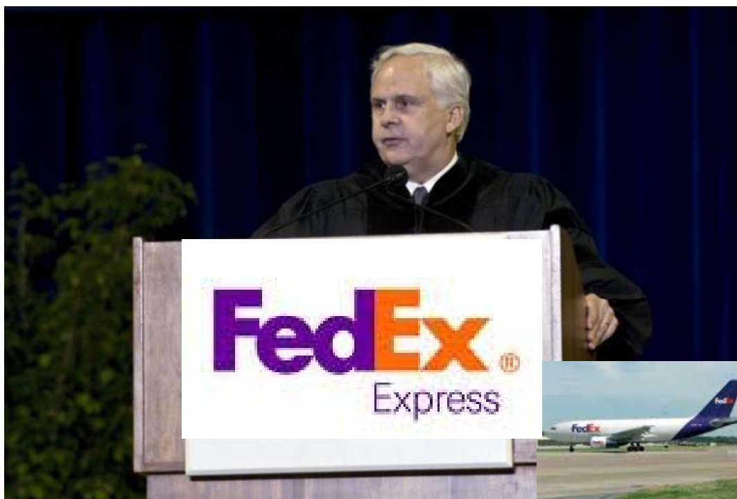
Fredrick Wallace Smith, Founder, President and CEO of FedEx